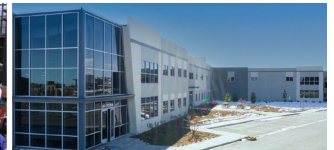
Colorado Technology Center