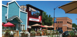
Historic Downtown Louisville