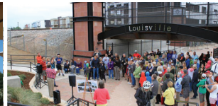
Downtown East Louisville