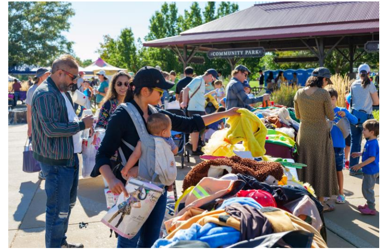
Ecotoberfest is on Saturday, October 5!